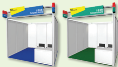
展台设计只供参考 For reference only